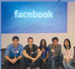
Bay area alumni event hosted by Facebook (Dec 2012)