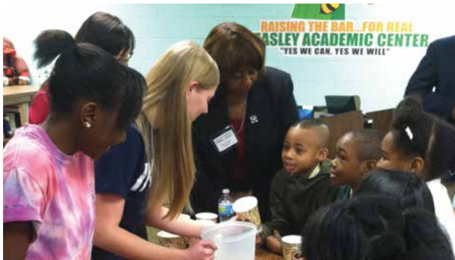
Illinois State Sen. Mattie Hunter watches Beasley Academic Center students participate in a states of matter science demo during IMSA's Chicago Field Office opening.

Through its recently relocated Chicago Field Office, IMSA joins forces with Chicago Public Schools to deliver professional development in mathematics and science instruction that focuses on inquiry and discovery; provide after school, weekend and summer mathematics and science programs for students; and address local needs by building and sustaining relationships with the local Chicago community. 360