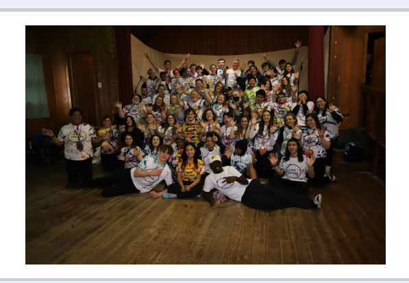
IMSA participated in Day of Silence on April 14th, 2023

GLSEN Day of Silence is a national student-led demonstration where LGBTQ+ students and allies all around the country—and the world—take a vow of silence to protest the harmful effects of harassment and discrimination of LGBTQ+ people in schools.